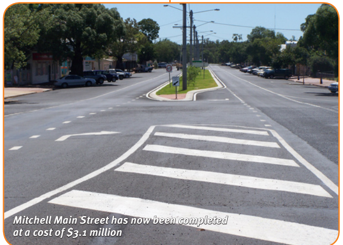
Mitchell Main Street has now been completed at a cost of $3.1 million