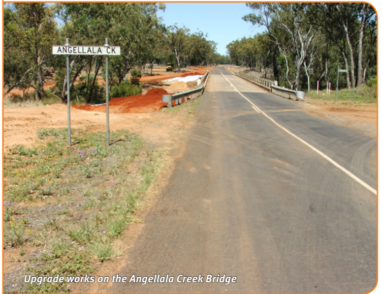
Upgrade works on the Angellala Creek Bridge

Road closure signs will be in place at the start of the link in the event access is cut between Charleville and Morven.