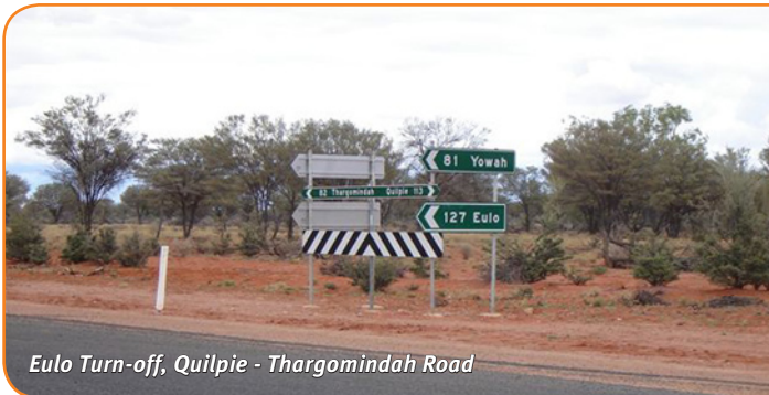
Eulo Turn-off, Quilpie - Thargomindah Road