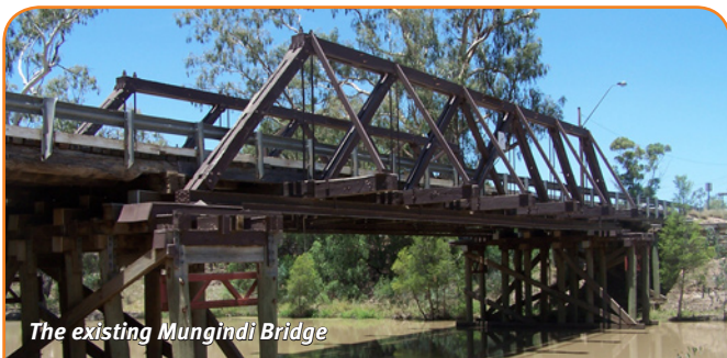
The existing Mungindi Bridge

Planning work is progressing on a project to replace the Mungindi Bridge over the Barwon River on the Queensland/New South Wales Border.