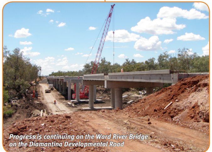
Progress is continuing on the Ward River Bridge on the Diamantina Developmental Road