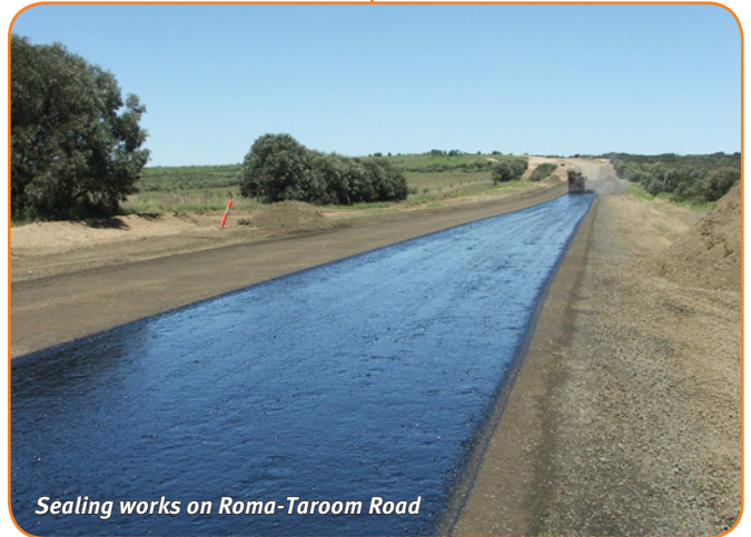
Sealing works on Roma-Taroom Road

Widening works are underway on the Warrego Highway (Morven to Charleville), approximately 30km west of Morven.